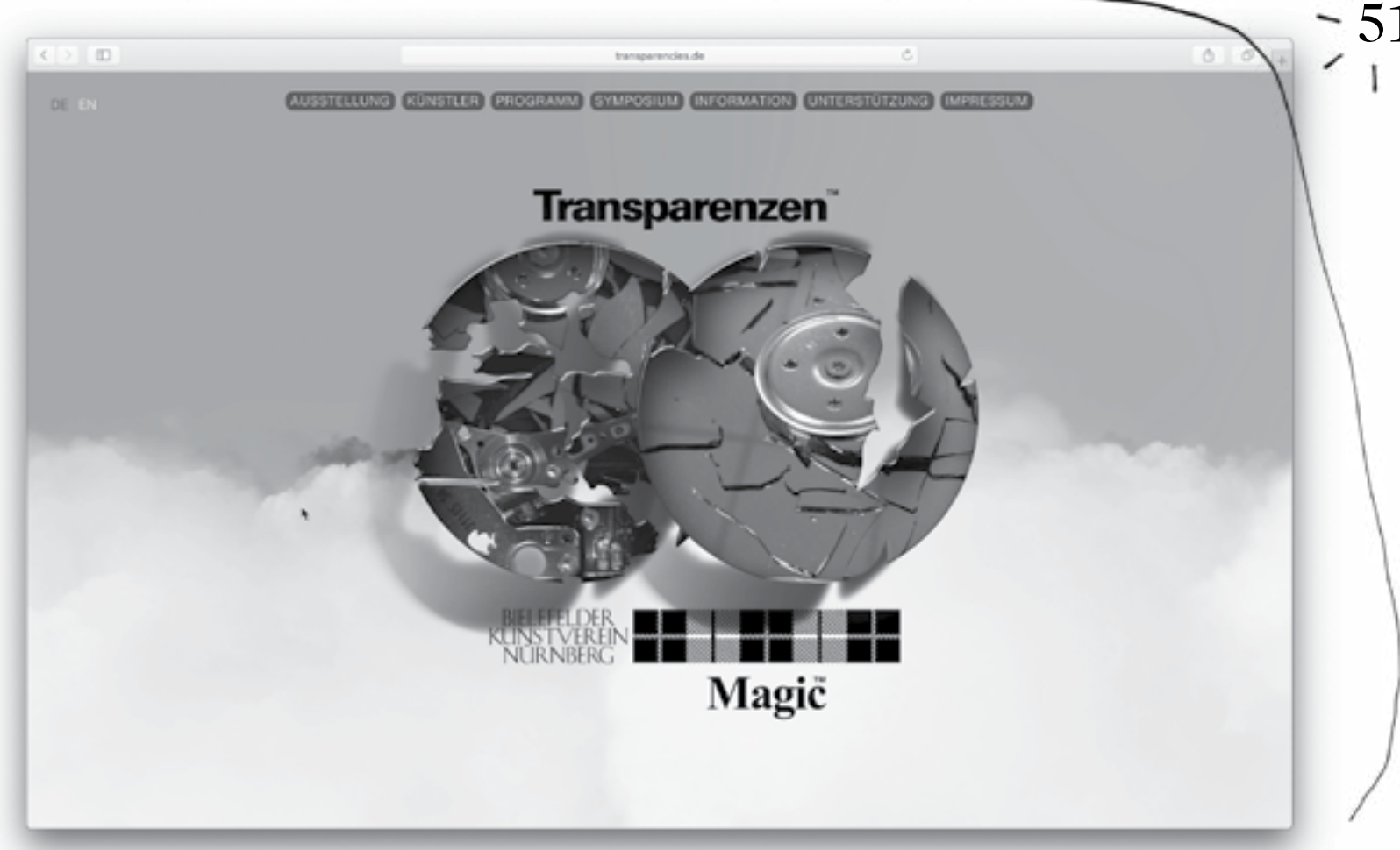
Website for the exhibition Transparencies, Bielefelder Kunstverein / Nürnberger Kunstverein, 2016, Screenshot

Normally, they're not made by people in Europe or the US, but in Bangladesh or India, where the people who make them get paid poorly. There's a whole economy behind these template engines. We don't use templates, and that's not what people come to us for. But when we were starting out, we did wonder if maybe it would be easier for us to buy a template and then alter it. We realized very quickly that it's so much easier to start from scratch so you can really do what you want to do and make it customized. CK: A lot of people don't have portfolio sites anymore—a lot of people just use Instagram. In 2008, every student of graphic design needed a website—you needed a portfolio and your own domain. But I think that's fading. Only few of our students have a personal website.